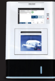
CORITEC 150i PRO