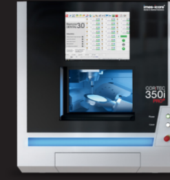
CORITEC 350i PRO+