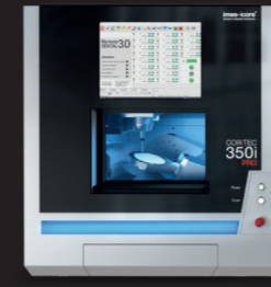
CORITEC 350i PRO