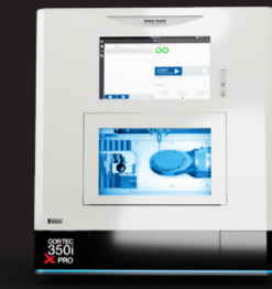
CORITEC 350i X PRO