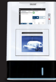
CORITEC 150i dry