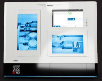
CORITEC 350i Loader X PRO