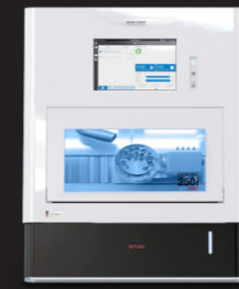
CORITEC 250i PRO+