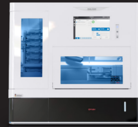
CORITEC 250i Loader PRO